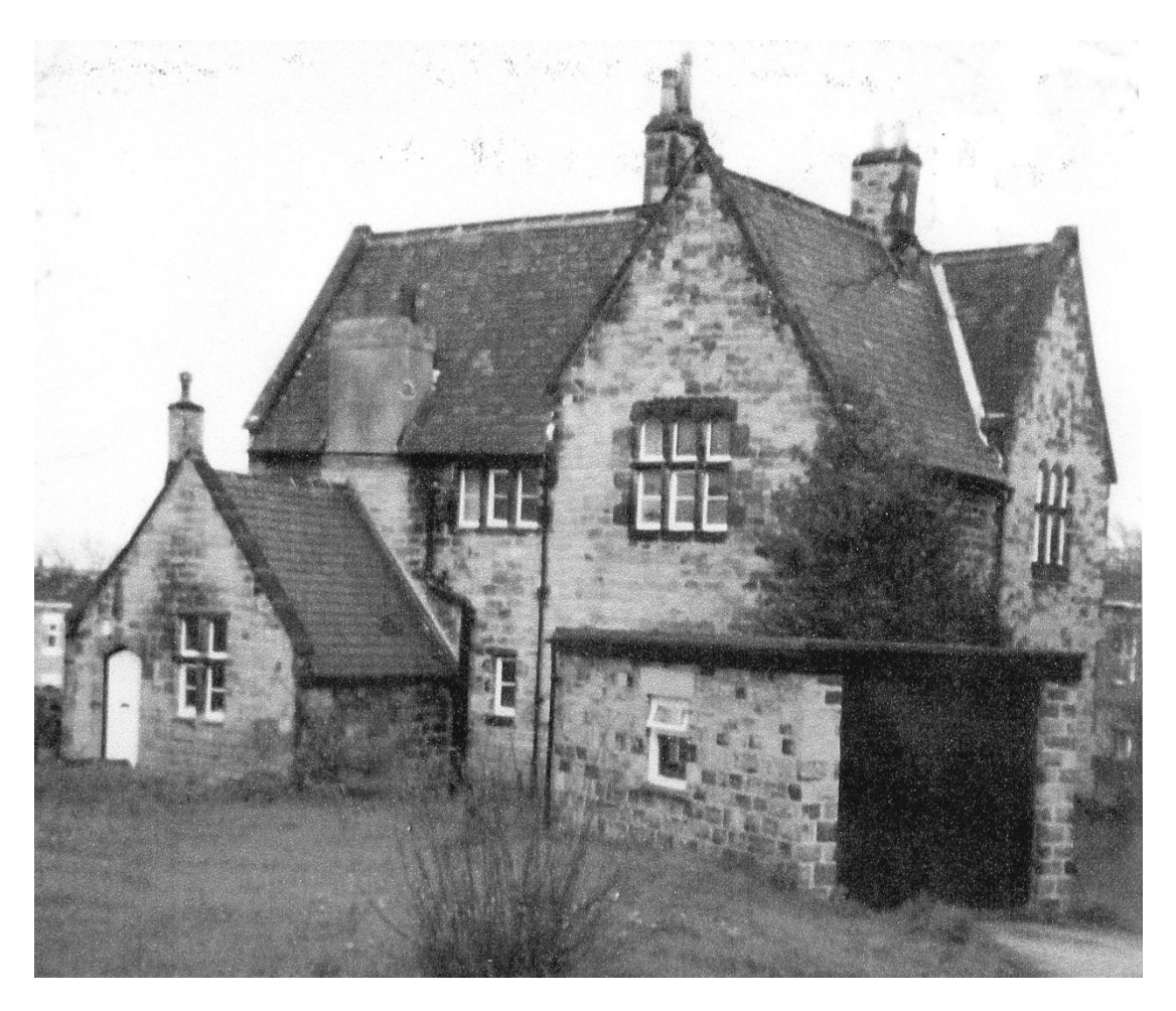
THE OLD VICARAGE BUILT IN 1853